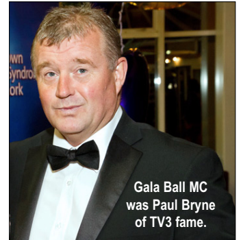
Gala Ball MC was Paul Bryne of TV3 fame.

Cancellations made with less than 48 hours notice must be charged in full as inadequate notice is given to schedule another client.